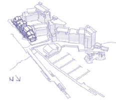
CHERRY BLOSSOM VILLAS Two and three bedrooms 1,428 – 2,932 sq ft