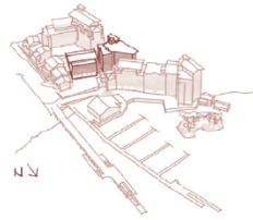
BAY VIEW VILLAS One and two bedrooms 651 – 4,353 sq ft