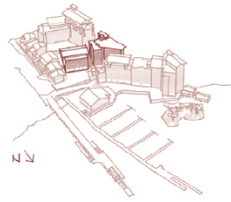
OCEAN PAVILION VILLAS One, two and three bedrooms 1,505 – 4,189 sq ft